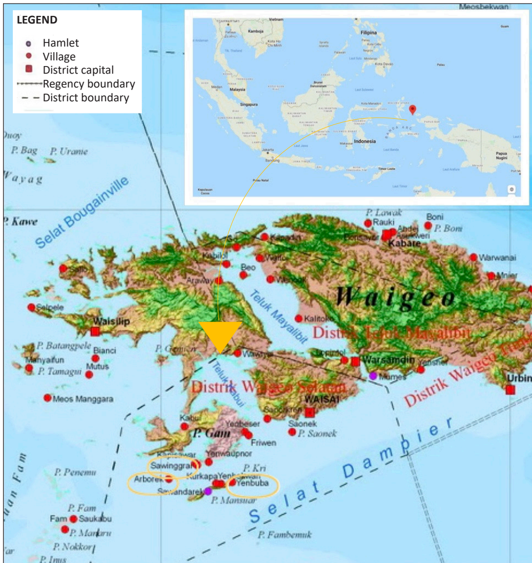
Figure 1. Locations of the study (Raja Ampat Regency Government, 2006; Google Earth)